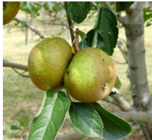
Roxbury Russets at Monticello

The Roxbury was among the most popular of early New England apples, not only because it has a complex, sweet-tart taste, good fresh and able to stand up to cooking, but because it ripens late and has exceptional storage properties. In the days before refrigeration, that was important!