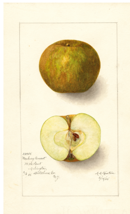
USDA lithograph of the Roxbury Russet

The exhibition programme is the result of a partnership between the Brightspace Foundation, Hereford Cider Museum, and the National Trust in Herefordshire, where more apples grow than anywhere else in the UK.